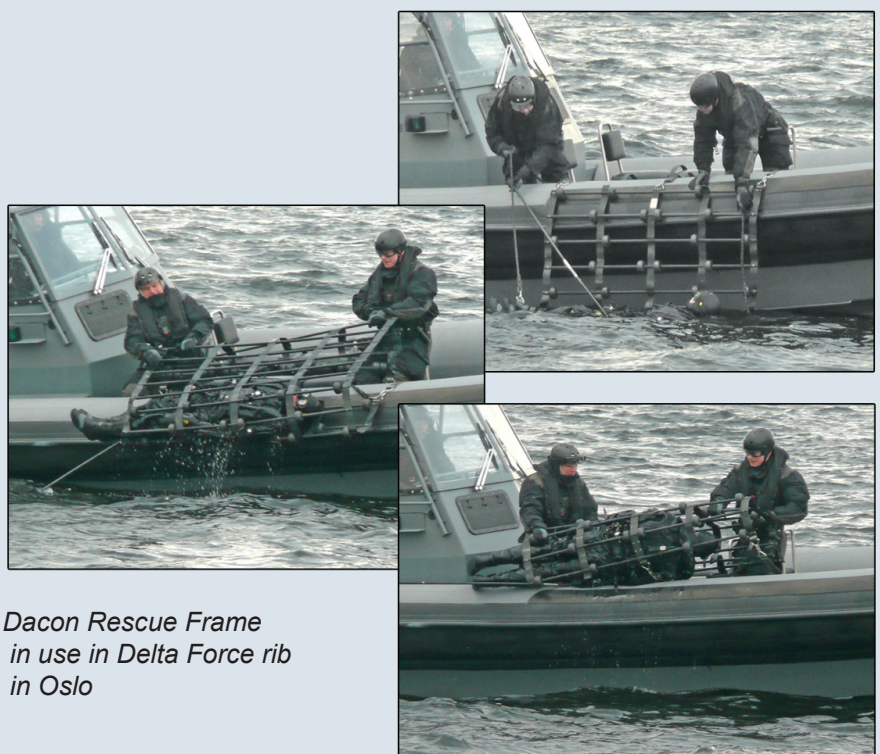
Dacon Rescue Frame in use in Delta Force rib in Oslo